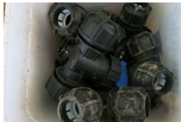
Various plumbing connectors i.e. elbows/T-junctions, etc. @ £0.50 each