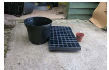
Large pots £1.00 each Small pots £0.50 each