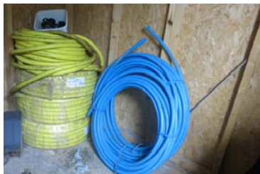
Tricoflex 25mm pipe @ £3.15 per metre Blue plumbing pipe 25mm @ £1.30 per metre

Please ask Ian if you are interested in the following items we have for sale: