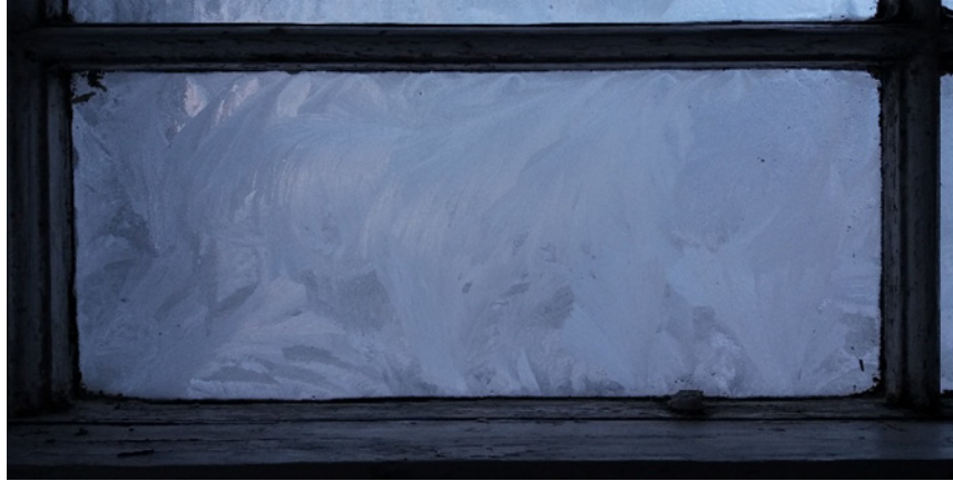
The first "Jack Frost" seen on a window-pane of Sanday's West Manse this century.

January brings the snow, Makes your feet and fingers glow. February's ice and sleet, Freeze the toes right off your feet. Welcome, March, with wintr'y wind, Would thou weren't not so unkind.