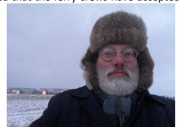
In Orkney, not Novaya Zemlya

Letter from School Place is available for downloading at lfsp.pbworks.com