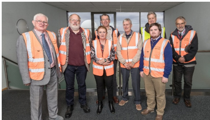
Tagged-up for the tour - note the Dounreay dome behind my left shoulder.

On my request, the latest meeting of the Dounreay Stakeholder Group (on which I represent OIC) was preceded in the afternoon by a tour of the "Home of Decommissioning Excellence". This was my first visit to a nuclear establishment for over 30 years, when I did a course in reactor physics (as part of my physics degree) at the University of London Reactor at Silwood Park in Berkshire. I was disappointed to learn that the iconic dome (see photographs below) is to be demolished rather than being retained as a national monument to Britain's nuclear industry (and continuing to be a landmark for shipping). At the evening meeting I asked about diffusion of tritium (a \beta -emitting isotope of hydrogen) from low-level radioactive metallic waste stored at the site, and I received a reassuring reply a week later. As a result of my conversations outwith the meeting, the UK Vertical Launch Project team is making arrangements to meet with Orkney councillors to explore areas that may be of mutual benefit.