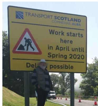
Inspecting progress of the A9 improvements.

Back in Kirkwall, I attended, by invitation, a Special Development & Infrastructure Committee meeting, went to a Special Policy & Resources Committee meeting, and rounded up the "Council year" with the General Meeting.