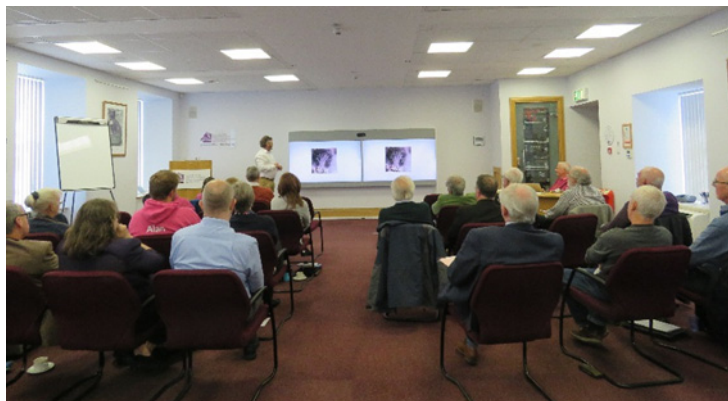
At the UHI Foundation Conference. (Spot the back of my head.)

Before the recess, I took two trips to Inverness on behalf of the Council, the first to attend the annual conference of the University of the Highlands & Islands Foundation, and the second to attend a meeting of the Highlands & Islands Science Skills Academy Leadership Board. (I am OIC's representative on both of these bodies.) There and back, I saw how work is progressing on improving the A9 at the Berriedale Braes. (Little did I think that during the recess, out of the blue, I would need to travel to Inverness yet again—this time to attend the Raigmore Hospital Eye Clinic as a patient!)